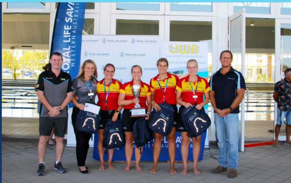
2021 Pool Lifeguard Challenge Winners - Armadale Fitness & Aquatic Centre