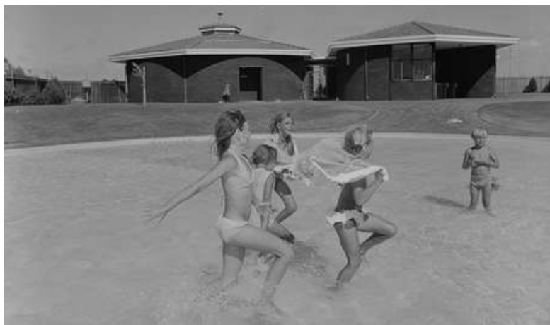
The Aquatic Centre opened to the community in 1973.