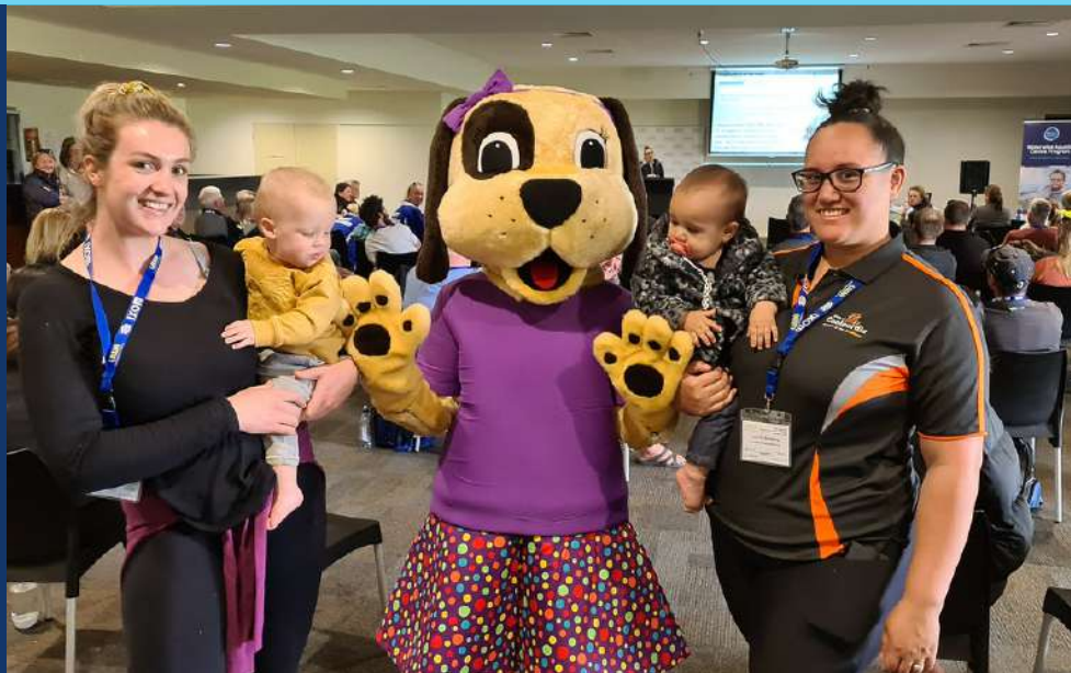
Meet "Wendy" the latest Watch Around Water Mascot